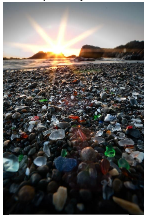
Glass Beach, Fort Bragg, CA

Sea glass collectors can often tell where and when the glass originated by its color. The most common colors of sea glass – kelly green, brown, white, and clear – come from modern beer, juice and soft drink bottles, as well as plates, drinking glasses, windshields and windows. Less common colors include jade,