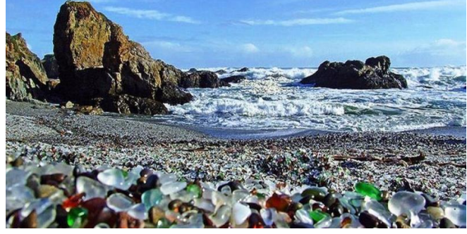
Glass Beach Fort Bragg, CA

Even less common colors include purple and cobalt blue (from early Milk of Magnesia bottles, poison bottles and Vicks VapoRub containers) and aqua (from Ball Mason jars). These colors account one in every 200 to 1,000 pieces found. Extremely rare colors include gray, pink (often from Great Depression-era plates), teal (Mateus wine bottles), yellow (1930s Vaseline containers), turquoise (from tableware and art glass), red (car tail lights and nautical lights) and orange. These colors account for every 1,000 to 10,000 pieces collected. Even harder to find is antique black glass that dates over 500 years old, thought to originate from pirates liquor bottles in the Caribbean!