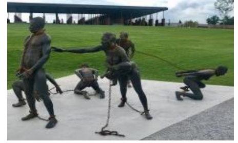
National Memorial for Peace & Justice Legacy Museum

The Racial Justice Pilgrimage is just around the corner. Twenty-two Emmanuel pilgrims will depart for Atlanta on February 17. At a recent gathering, pilgrims shared some of what they were looking forward to and what they were fearful of. The word clouds below are the result: